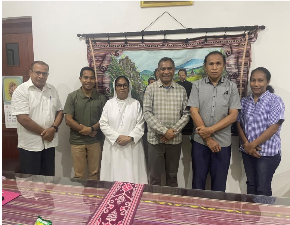
Meeting with SDB Province in 2021.