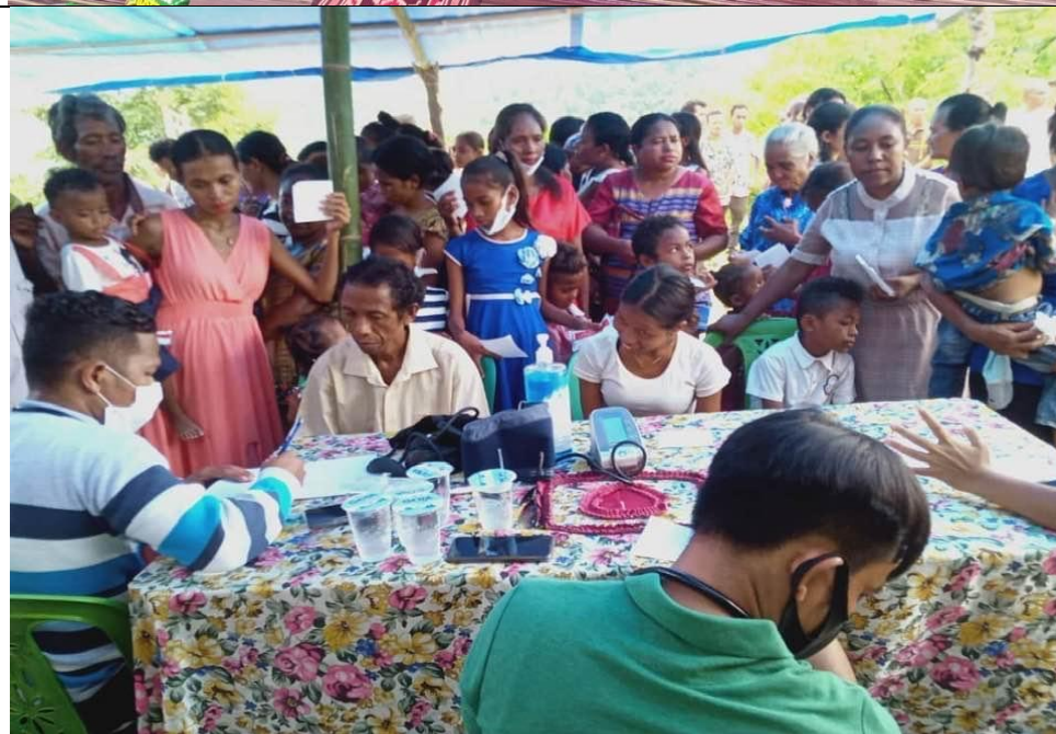
Social ACTIVITY. Provided medical treatment to the rural communities. Supported by local clinics (nurses and doctors).